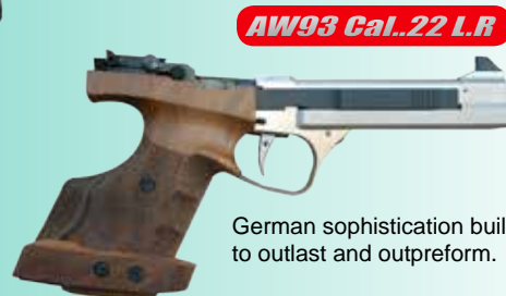
AW93 Cal..22 L.R

German sophistication built to outlast and outperform.