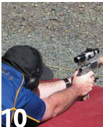
10 World Action Pistol Championships

The views expressed in this magazine do not necessarily reflect the policies of Pistol Australia Inc.