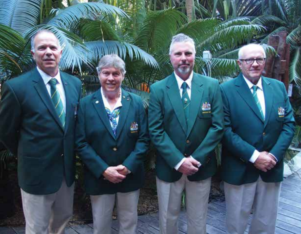
< Australian Team

ammo was expended by 15:00, so we headed back to the Hotel via the supermarket for a quick swim before dinner.