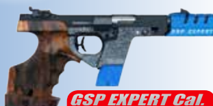
GSP EXPERT Cal.32 S&W Long.