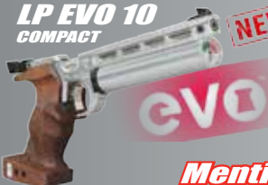
LP EVO 10 COMPACT