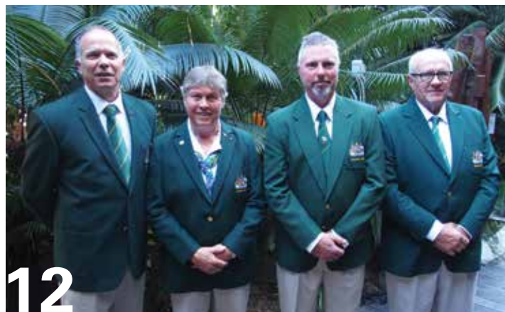
12 Oceania Championships