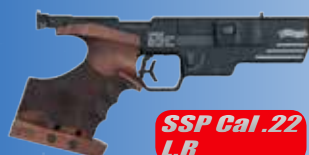
SSP Cal.22 L.R