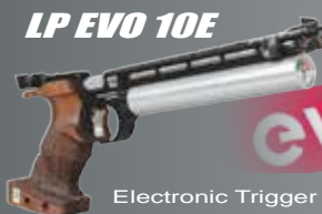
LP EVO 10E