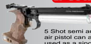
LP 50 Air Pistol

5 Shot semi automatic air pistol can also be used as a single shot.