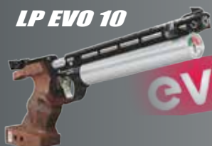
LP EVO 10

5 Shot semi automatic air pistol can also be used as a single shot.