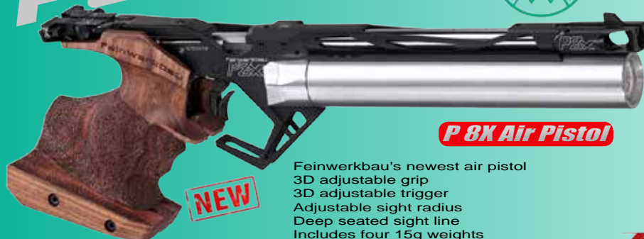
P 8X Air Pistol

Feinwerkbau® Westinger & Altenburger GmbH